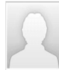
VACANT 3 rd BH Liaison to join the team in March 2022

Please contact our BHL's directly regarding care coordination.